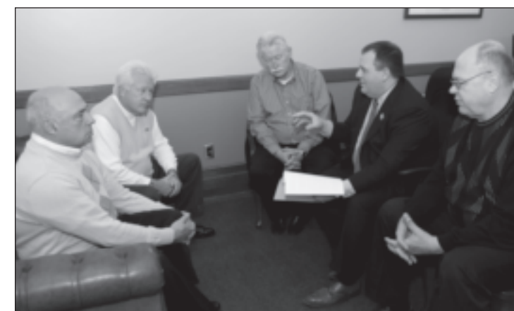
Rep. Craig discusses Assembly Bill 346, regarding the licensing requirements for kennels, with residents of the Waterford area.

These bills will ensure that major decisions governing Wisconsin's health care and insurance industry will be made only through the stability and predictability of statute while also allowing state legislators and Wisconsin's congressional delegation to monitor the impact of ObamaCare on our state.