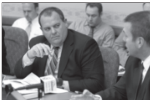
Rep. Craig questions OCI Deputy Commissioner Daniel Schwartzer during a public hearing on Assembly Bill 210, which implemented portions of ObamaCare in Wisconsin. Craig later voted against the bill.

Asian Carp: This session both the Assembly and Senate passed a bill I authored, Assembly Bill 377, changing the definition of Asian Carp to rough fish and allowing the taking of all rough fish with a crossbow. Classifying Asian Carp as "rough fish" allows for them to be harvested like common carp, changing the DNR rule that allowed the taking of only one Asian Carp per day. This bill is good news for disabled sportspeople, who are often unable to participate in sports like bowfishing. AB 377 is also good news for the environment, as it allows Wisconsin's sportsmen and women to help fight the infestation of our waterways by nonindigenous fish that harm our aquatic ecosystems.