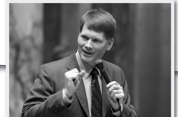
Rep. Thiesfeldt speaks on the Assembly floor during a debate

Jeremy Thiesfeldt State Representative 52 nd Assembly District