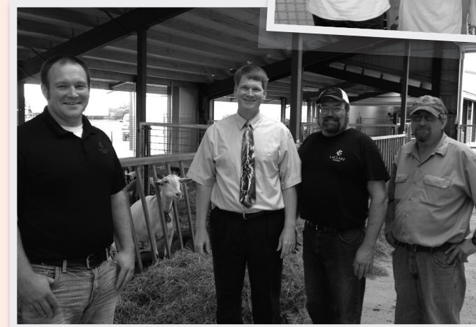
Rep. Thiesfeldt visits the LaClare Farms where goats are raised for their milk to be made into cheese and other dairy products