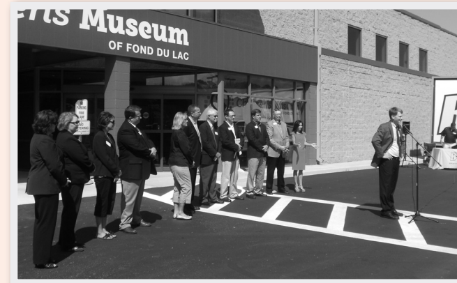
Rep. Thiesfeldt shares remarks at the Fond du Lac Children's Museum Grand Re-opening Ribbon Cutting Ceremony

AB 695 – Regulation of Motor Air Conditioners (On Governor's desk): This bill removes unnecessary and duplicative state regulations and permits motor vehicle air conditioner repair centers to compete to provide this service to the public, while remaining subject to federal regulations. The bill removes red tape from the state for repair centers and will save them $120 annually.