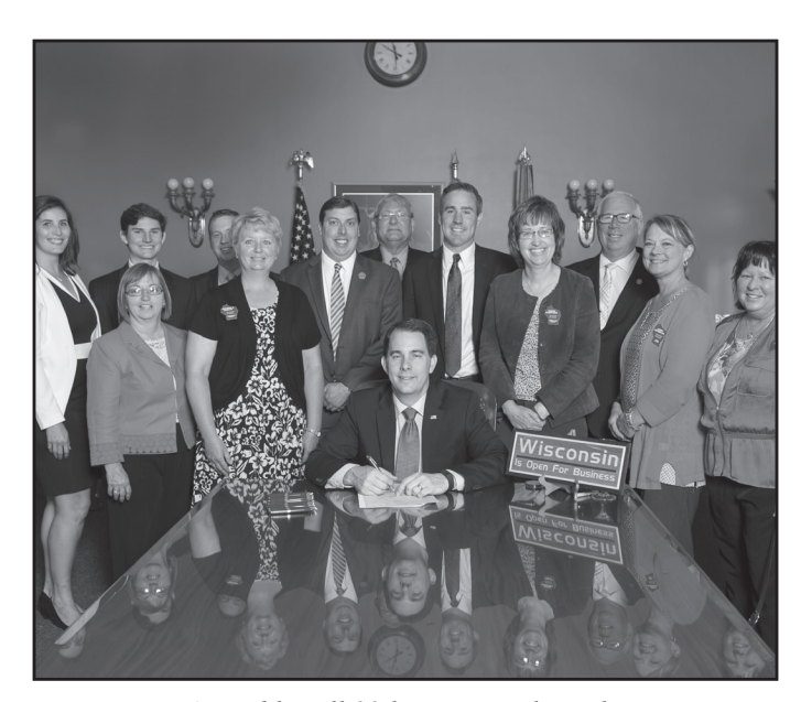
Assembly Bill 82 being signed into law.