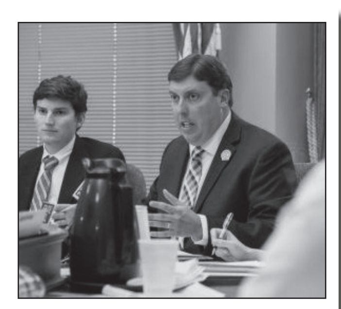
Rep. Born presides over the Assembly Committee on Public Benefit Reform.