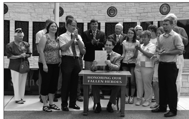
Assembly Bill 166 being signed into law in Mayville.