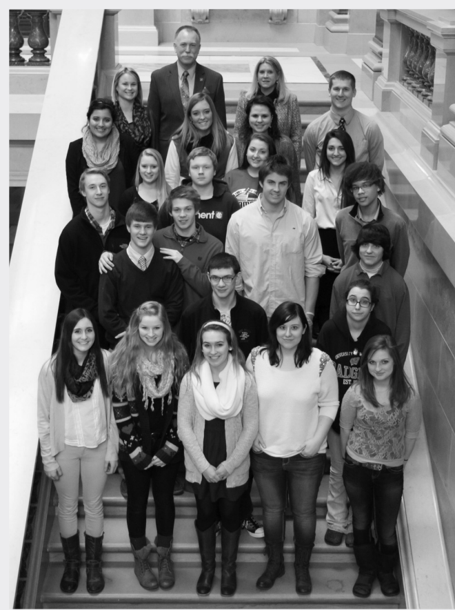
Amy and Senator Kedzie welcome students from Big Foot High School

A Citizen's Guide to Participation in the Wisconsin State Legislature introduces you to the functions of the legislature, finding your elected official, researching legislative documents and bills and offers other resource tools related to the legislative process. The guide is available at http://legis.wisconsin.gov/lc/