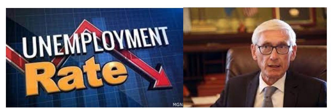
State's Unemployment Rate Hits Record Low

In 2020 alone, Americans lost $520 million through robocall scams.