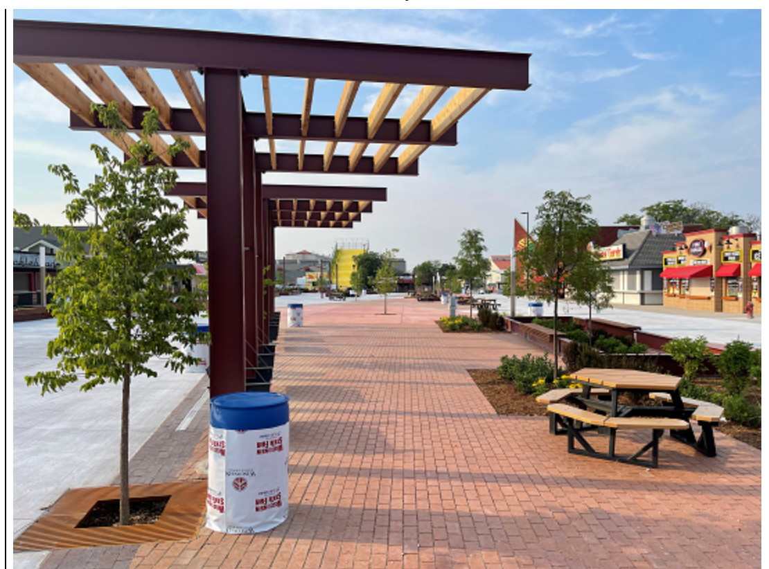
Next year, the Wisconsin State Fair plans to renovate the restroom on the Central Mall: