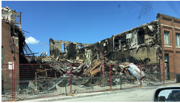
Damage in the "Uptown" business district of Kenosha

On Tuesday night, armed militias had organized in order to counterprotest and dissuade the actions of rioters. This culminated in the deaths of 2 people and serious injury to one other after an altercation between protesters and a 17 year old resident of Antioch, IL, who had come to participate with the militias, although the young man was not legally permitted to carry a firearm due to his age.