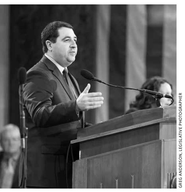
Attorney General Josh Kaul delivers remarks after being sworn in for a second term as Wisconsin's 45th attorney general.

state in criminal cases on appeal in federal court.