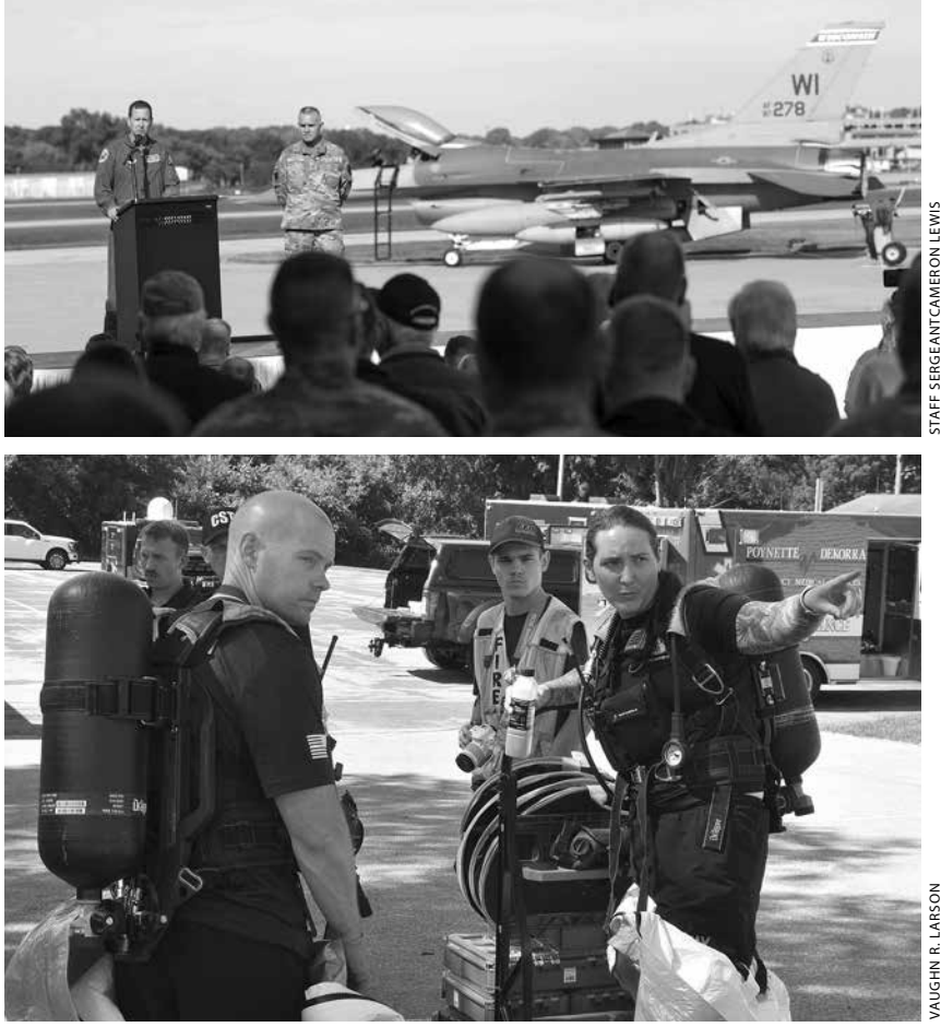
(top) The Wisconsin Air National Guard's 115th Fighter Wing pays tribute to the legacy of the F-16 Fighting Falcon aircraft during a ceremony held at Truax Field in Madison. (bottom) Members of the Wisconsin National Guard's 54th Civil Support Team plan their entrance into a building during a hazardous materials training exercise in Poynette.

state governments. When it is called up for active federal duty, the president of the United States, rather than the governor, becomes its commander in chief. The federal mission of the National Guard is to provide trained units to the U.S. Army and U.S. Air Force in time of war or national emergency. Its state mission is to assist civil authorities; protect life and property; and preserve peace, order, and public safety in times of natural or human-caused emergencies. The federal government provides the National Guard with arms and ammunition, equipment and uniforms, and major outdoor training facilities and pays for military and support personnel, training, and supervision. The state provides personnel; con-