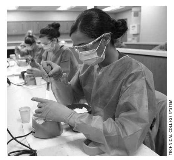
The Wisconsin Technical College System prepares students for a variety of careers. Above, students at Blackhawk Technical College who are training to become dental technicians practice mixing materials for dental molds.

College System. The governor, with the advice and consent of the senate, appoints 10 of the board's 13 members, nine to serve six-year terms and a technical college student to serve a two-year term. Of the nine nonstudent appointees, there must be at least one employer, one nonmanagerial employee, and one farmer. The three remaining board members are the state superintendent of public instruction, the secretary of workforce development, and the