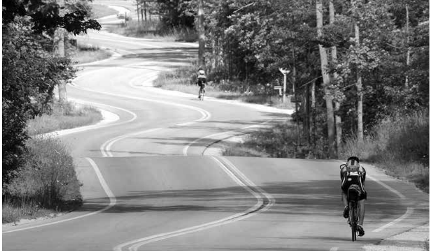
Wisconsin's Rustic Roads program was established in 1973 to help citizens and local governments preserve the state's remaining scenic country roads. Above, cyclists enjoy a winding ride on State Highway 42 in Door County.

The Rustic Roads Board oversees the application and selection process of locally nominated county highways and local roads for inclusion in the Rustic Roads network system. The Rustic Roads program is a partnership between local officials and state government to showcase some of Wisconsin's most picturesque and lightly traveled roadways for the leisurely enjoyment of hikers, bikers, and motorists.