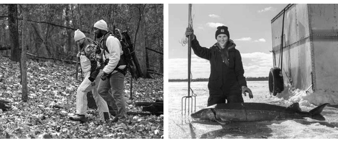
In 2022, the Department of Natural Resources issued more than 800,000 hunting licenses and over one million fishing licenses, including around 13,000 sturgeon spearing licenses. Above, two hunters hike through the woods ( left ), and a spearer poses with the fish she harvested during the 2023 sturgeon spearing season ( right ).

rural community fire protection program. In addition, the council provides fundamental guidance on the administration of the Forest Fire Protection Grant.