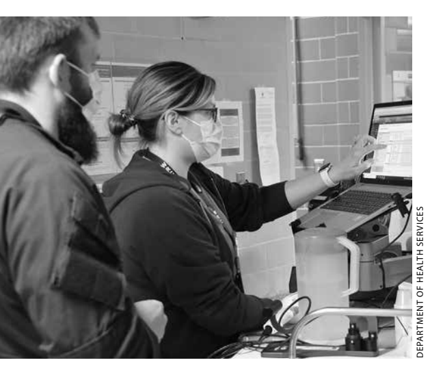
A staff member at the Wisconsin Resource Center reviews a patient's electronic health records. The center develops innovative treatment methods for state prison residents in need of specialized mental health services.