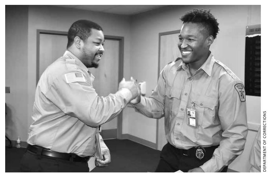
Correctional officers share congratulations after graduating from the Department of Corrections' Officer Pre-Service Academy.

Location: 3099 East Washington Avenue, Madison Contact: 608-240-5000; PO Box 7925, Madison, WI 53707-7925 Website: https://doc.wi.gov Number of employees: 10,261.52 Total budget 2021-23: $2,838,410,000