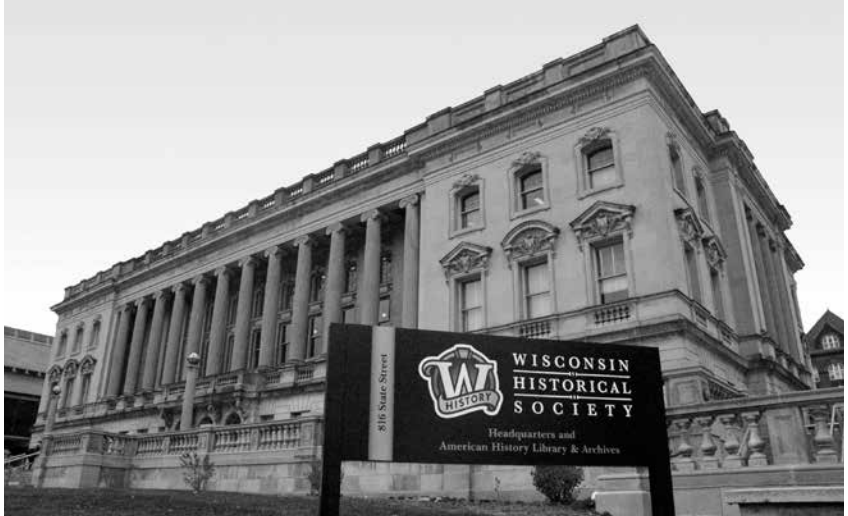
The headquarters of the Wisconsin Historical Society anchors Library Mall on the University of Wisconsin–Madison campus. It houses extensive library and archival collections, including the Wisconsin Center for Film and Theatre Research, a noteworthy collection of materials relating to the entertainment industry.