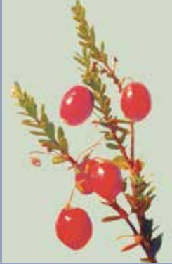
FRUIT Cranberry ( Vaccinium macrocarpon )