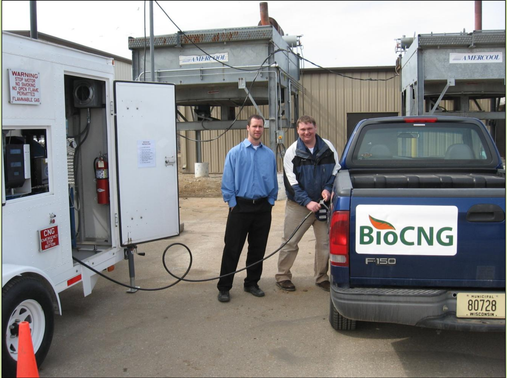
Dane County First BioCNG Vehicle Fueled March 18, 2011