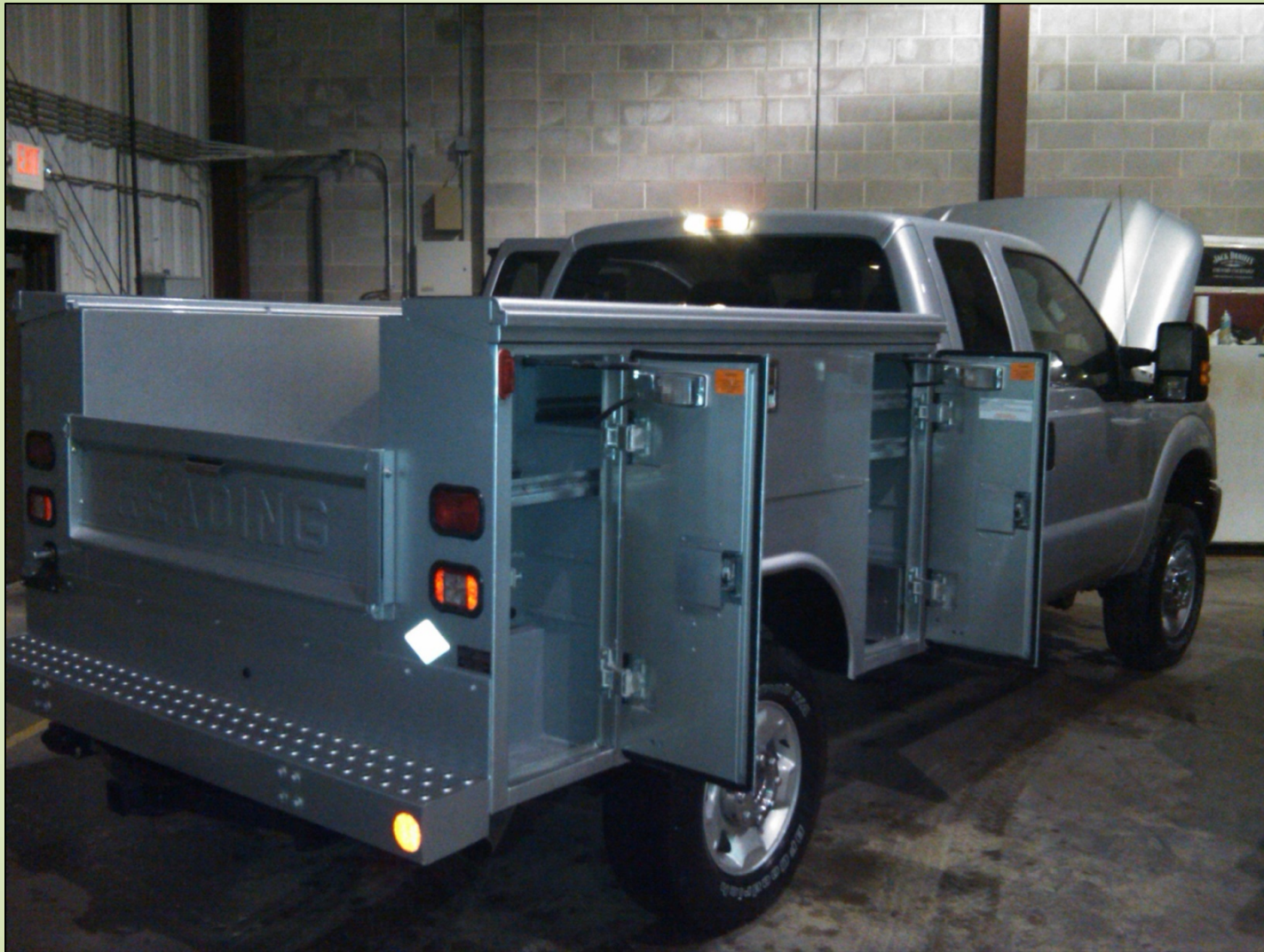
Ford 2011 F350 CNG / Gasoline Pickup Truck Delivered to Dane County January, 2012