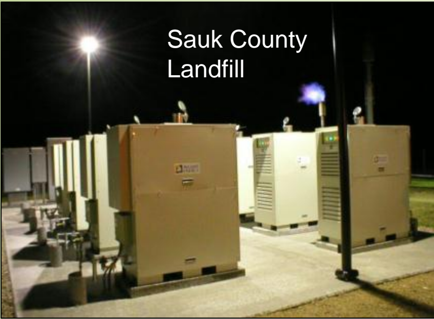
Sauk County Landfill