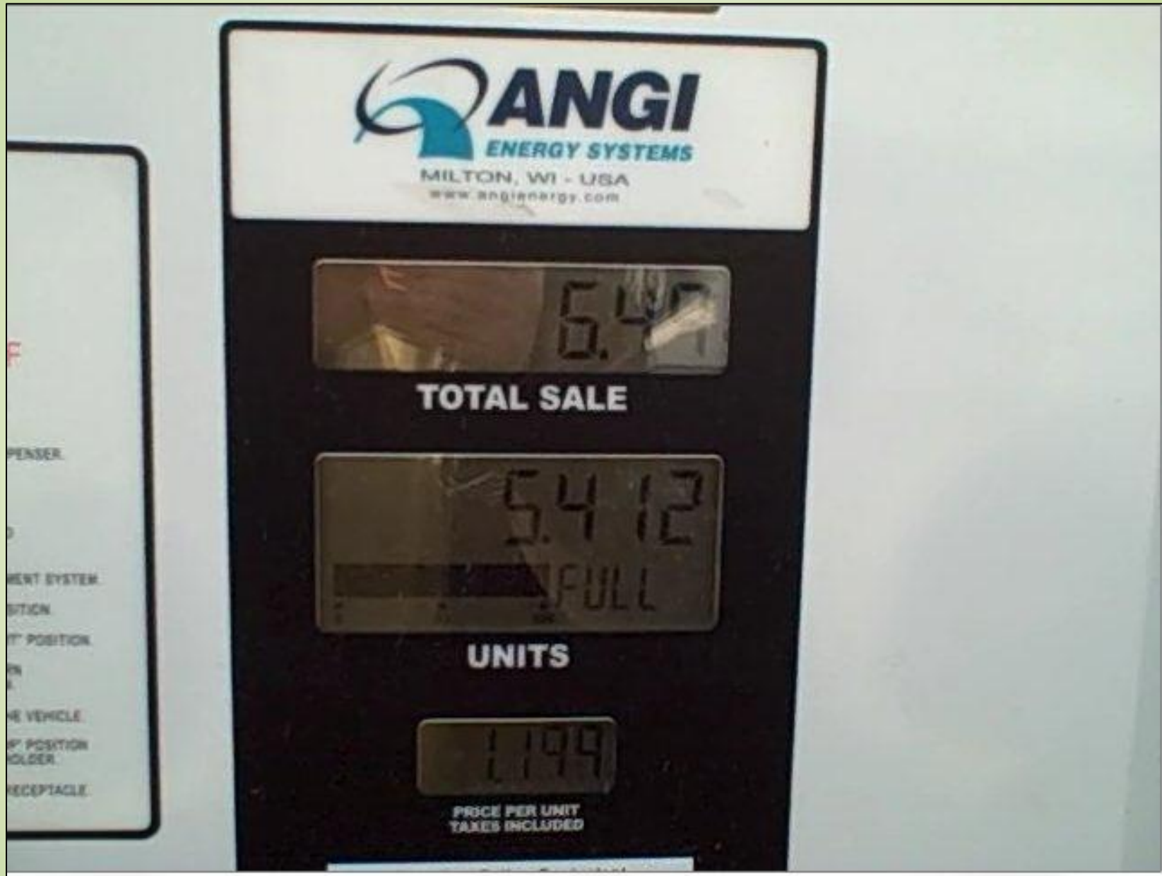
Topeka, Kansas January, 2012 $1.199 / Gasoline gallon Equivalent (GGE)