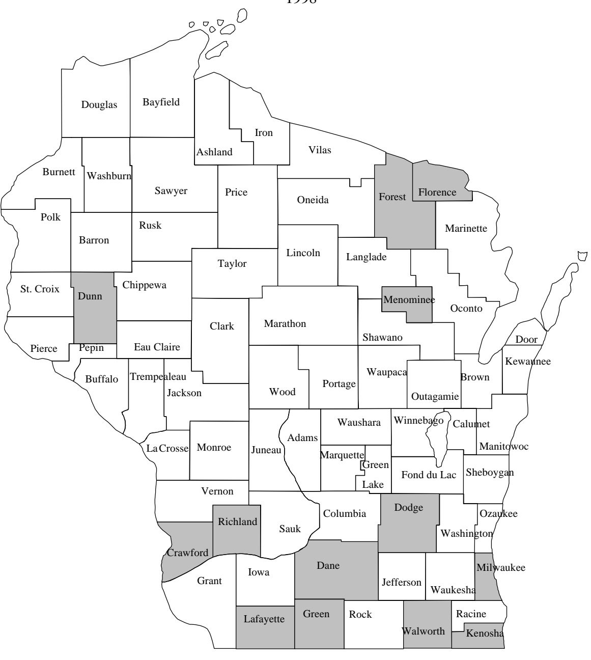
Figure 2 Counties' Use of the 30-day Dispositional Placement 1998

White = County Board has authorized disposition