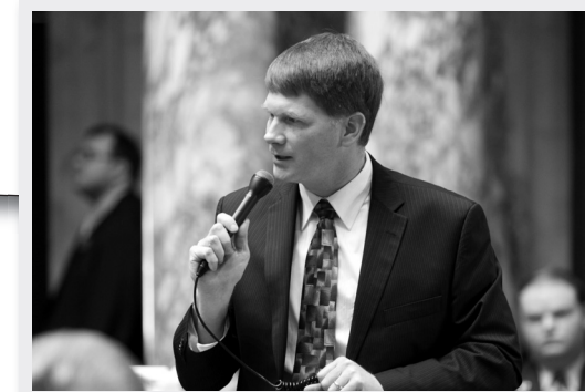
Rep. Thiesfeldt speaks on the floor of the Assembly during a debate.