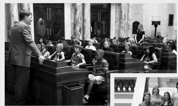
Rep. Thiesfeldt speaks with students from Evans Elementary during their capitol tour.