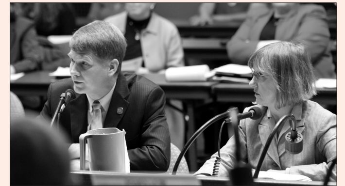
Testifying with Sen. Lazich on the Strong Communities & Healthy Kids Bill during an Assembly Committee on Education hearing.

Higher education was protected by preventing schools from cutting financial aid to students seeking a college education. Schools were allowed to offset budget reductions through increased pension and healthcare contributions.