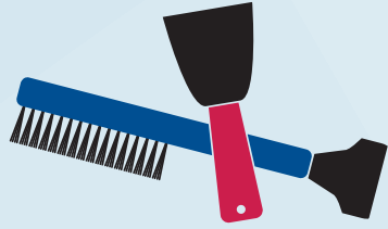
ice scraper/snow brush