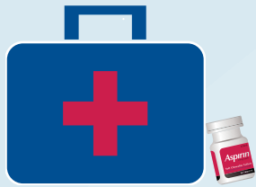
first aid kit don't forget your medications