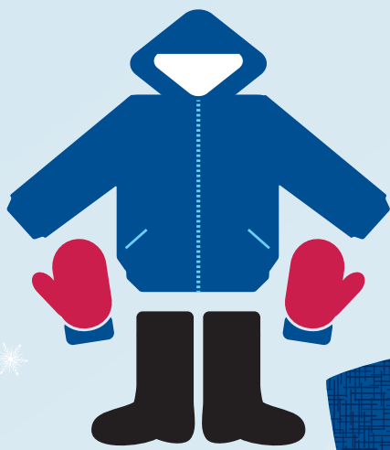
boots, gloves blankets, warm clothes