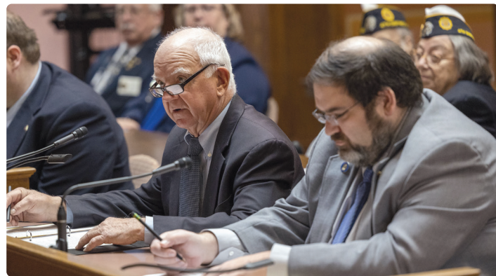
Rep. Edming testifies in support of AB 102 which would expand the eligibility for the disabled veteran and surviving spouse property tax credit.

Currently, a veteran must have a service-connected disability rating of 100% in order to qualify for the credit. I brought forward legislation lowering that threshold to 70%. By expanding the eligibility for this credit we are providing property tax relief that will allow more of our disabled veterans and their spouses to stay in their homes and out of more costly alternatives such as long-term care facilities. Not only does keeping these folks in their homes save money, but also preserves a higher quality of life. At the time I am writing this update, this proposal has been approved by the Assembly. I hope that by the time this newsletter reaches your mailbox, it will have cleared the Senate and been signed into law by Governor Evers.