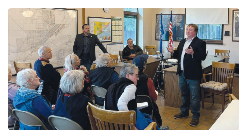
Senator Quinn and I talking to constituents during a listening session in Washburn.