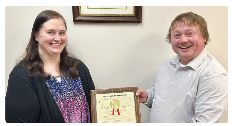
Presenting the Bayfield County DA with a citation for winning 2023 District Attorney of the Year in Wisconsin.