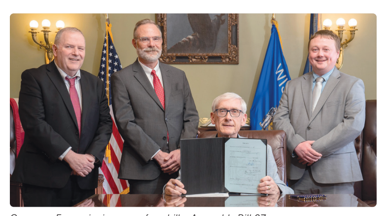
Governor Evers signing one of my bills, Assembly Bill 67.