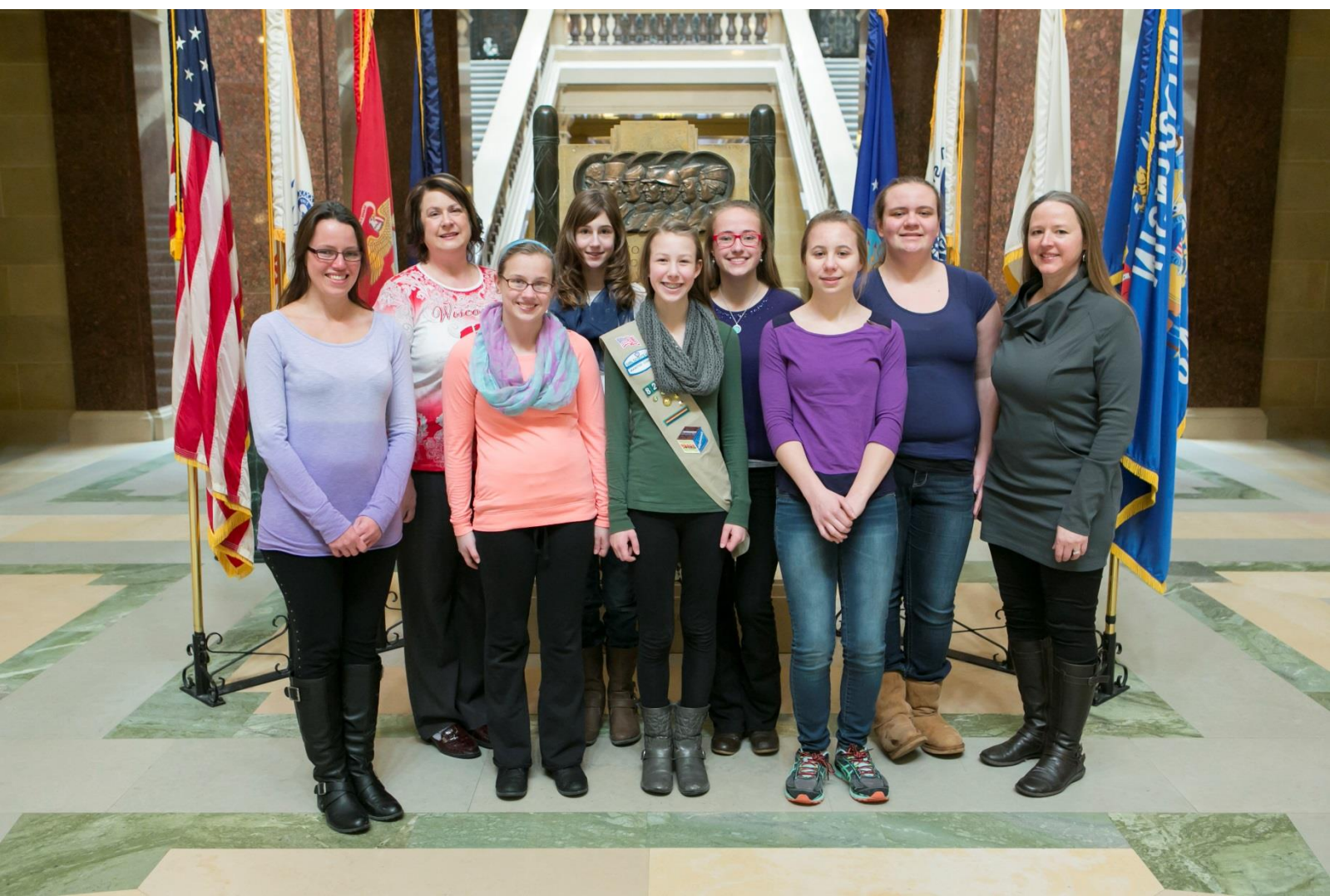
It was a pleasure to welcome members of Girl Scout Troop 8207 from Belgium and Cedar Grove to the State Capitol for a tour.

My office is currently scheduling a series of listening sessions to be held throughout the district. As more information becomes available, I will post the dates, times and locations on social media pages and websites. Furthermore, I will include them in my next e-update.