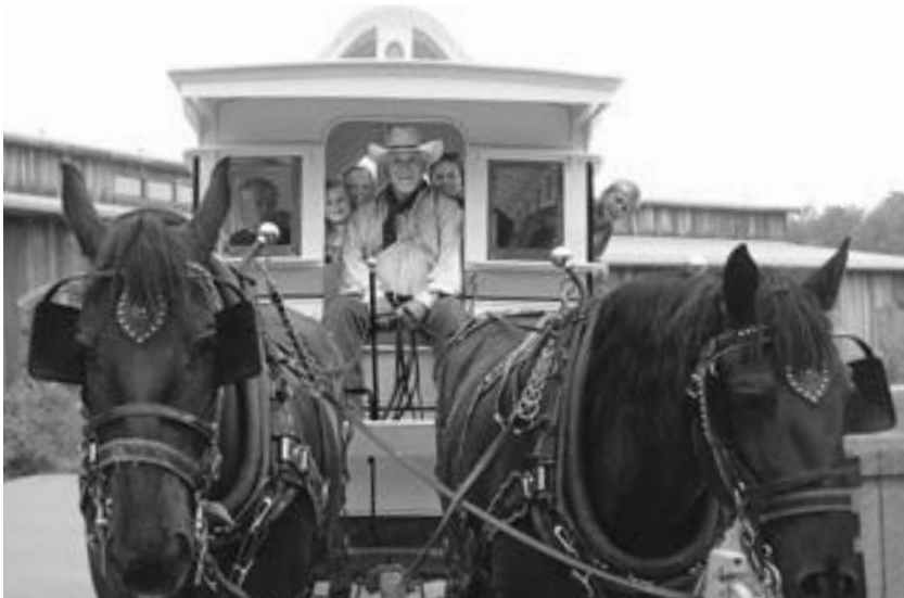
The Wisconsin State Historical Society is an executive branch agency that preserves historical and cultural resources such as the Wade House historic site, a stagecoach inn from the 1850s. Above, visitors enjoy a ride in an omnibus.

13. According to pp. 4–7, Wisconsin has six executive officers. Which one is nonpartisan?