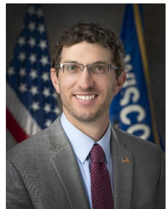
Rep. Travis Tranel