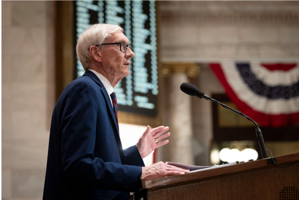
Governor Evers delivering his budget address at the State Capitol on February 18th, 2025