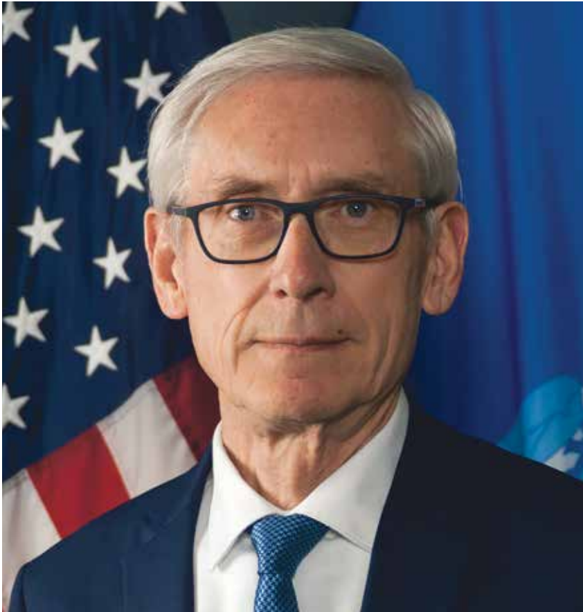
Tony Evers , Governor Democrat

Personal: Born Plymouth, Wisconsin, November 5, 1951; married; 3 children, 9 grandchildren.