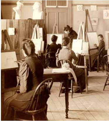
WHS IMAGE ID 25774

1852. The Wisconsin School for the Deaf opened in Delavan. ■ Prison construction begun at Waupun.