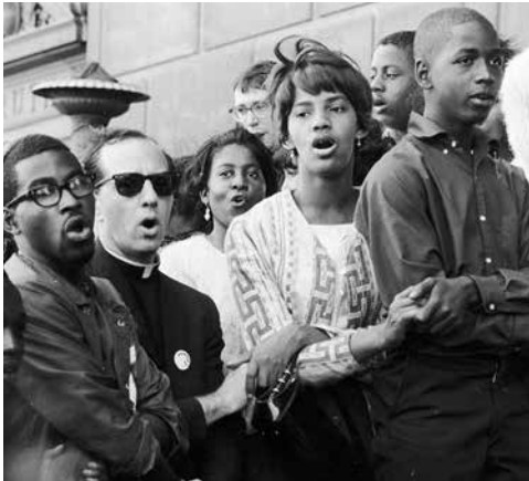
Father Groppi with civil rights activists.