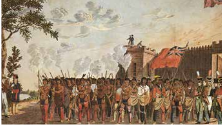
Fort Shelby, renamed Fort McKay.

1815. The War of 1812 concluded, leading to the abandonment of Fort McKay (formerly Fort Shelby) by the British.