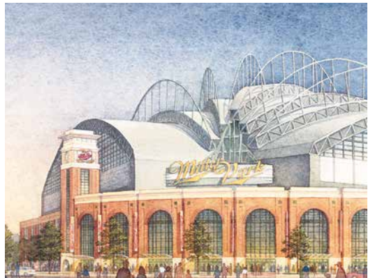
Artist's rendering of Miller Park Stadium.

1998. Tammy Baldwin became the first Wisconsin woman and first openly gay woman elected to U.S. Congress. ■ The U.S. Supreme Court upheld the constitutionality of the extension of Milwaukee Parental Choice school vouchers to religious schools. ■ Laws enacted