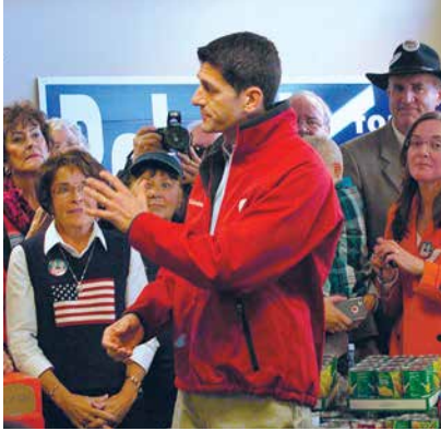
WHS IMAGE ID 110369

of the state senate, and Tammy Baldwin became the first Wisconsin woman and first openly gay woman elected to the U.S. Senate.