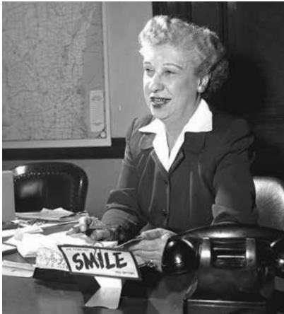
WHS IMAGE ID 84154