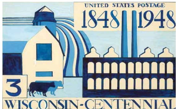
Wisconsin Centennial postage stamp.

1950. Approximately 132,000 Wisconsinites served during the Korean Conflict, and 747 died.