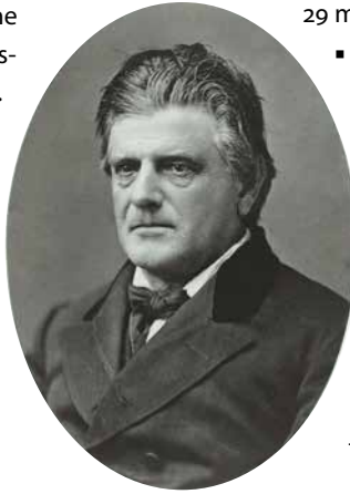
Governor Nelson Dewey.

1848. The second proposed state constitution was adopted. ▪ President Polk signed a bill on May