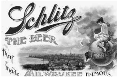
Schlitz Brewing Company.

Brewery Company of Detroit acquired the Schlitz Brewing Company and closed all Milwaukee operations.