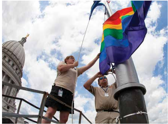
A rainbow flag at the Capitol.

2020. Governor Tony Evers declared a public health emergency in response to the COVID-19 pandemic; some related