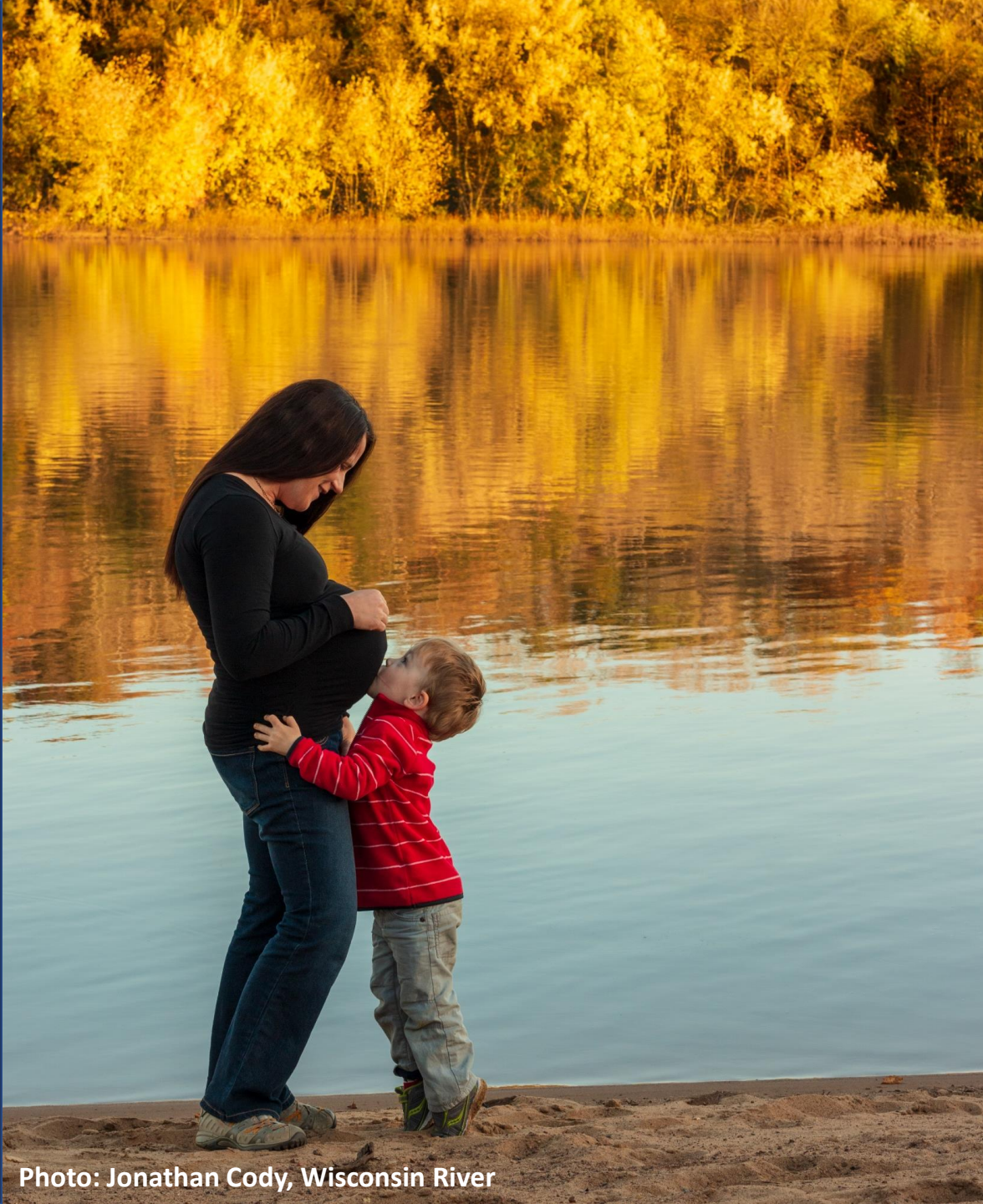
Wisconsin River