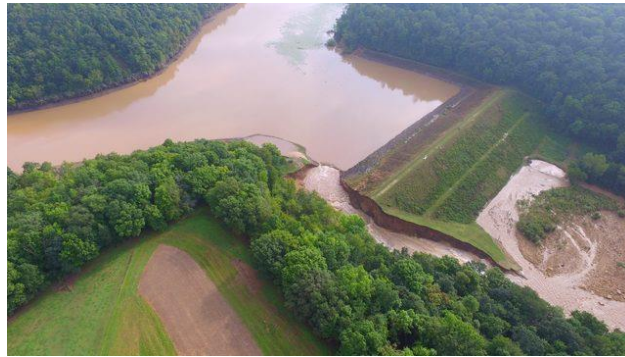
Jersey Valley Dam