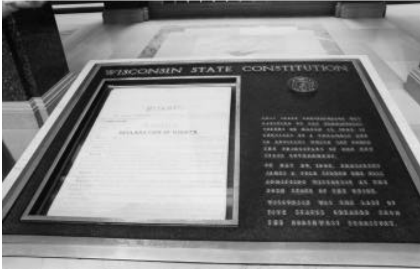
This opening page of the Wisconsin State Constitution on permanent display in the State Capitol is expected to draw many interested viewers as Wisconsin celebrates the 150th anniversary of its statehood.

Sources: 1995-96 Wisconsin Statutes; State Elections Board, departmental data, April 1997; Wisconsin Department of Employment Relations, Division of Classification and Compensation, departmental data, April 1997.