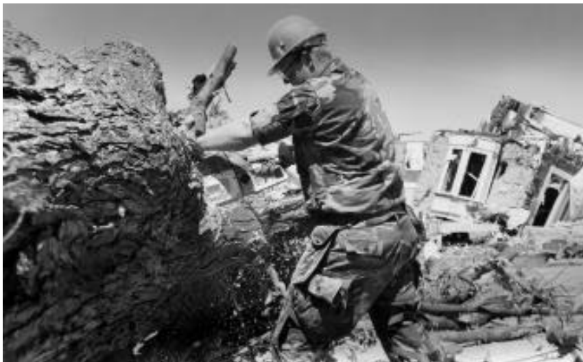
Company A, 724th Engineer Battalion, Wisconsin Army National Guard on Main Street in Oakfield, after a tornado destroyed much of the village of 1,000.

Source: Appointment lists maintained by governor's office and received by the Legislative Reference Bureau on or before June 30, 1997.