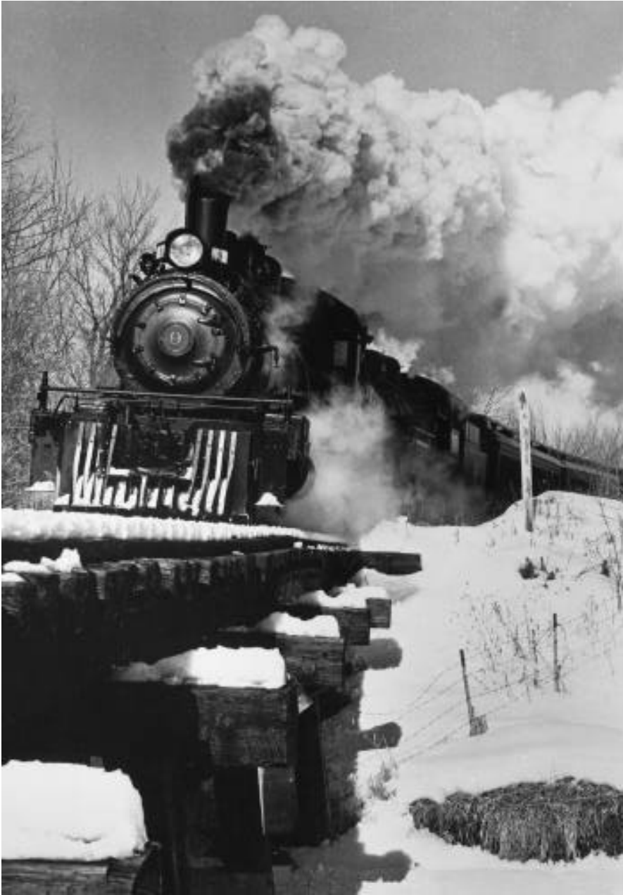
Among Wisconsin's many tourist attractions is the Mid-Continent Railway Museum, where youngsters of the Space Age can experience the thrill of by-gone days when steam was king. Here Number 9 crosses Seely Creek on its "Snow Train" run. (Wisconsin Department of Tourism)