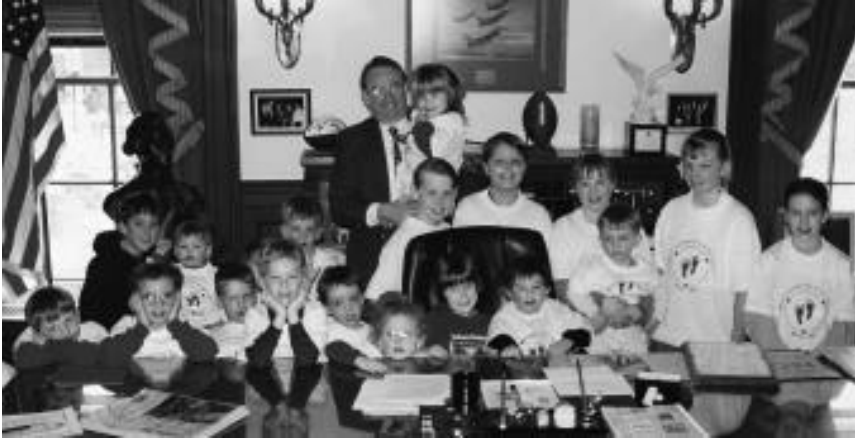
A group of young admirers join Governor Tommy G. Thompson in the executive office to celebrate the signing of the Healthy Baby Month proclamation on March of Dimes Day at the Capitol, March 12, 1997.