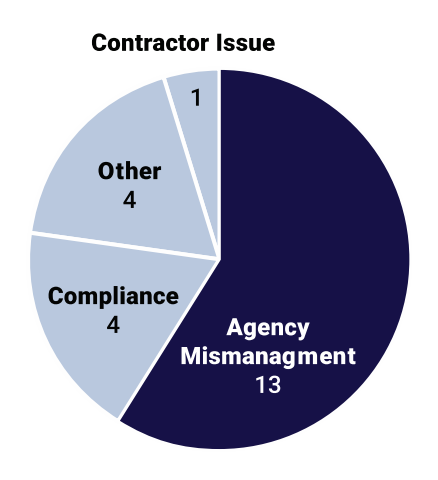
Figure 1 Reports of Fraud, Waste, and Mismanagement in State Government<sup>1</sup> July through December 2022

<sup>1</sup> Includes 22 state-related reports received from July 1, 2022, through December 31, 2022.