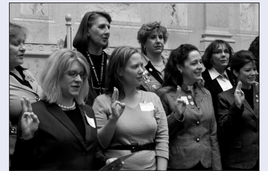
Rep. Kerkman and legislative colleagues are inducted as members of Honorary Girl Scout Troop 1912 at a ceremony celebrating the 100th anniversary of the founding of the Girl Scouts of America

Caylee's Law passed overwhelmingly in both houses of the legislature, and at press time was awaiting the Governor's signature to become law.