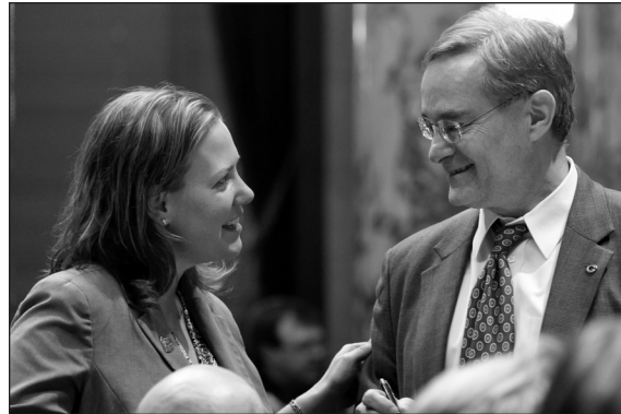
Rep. Kerkman discusses legislation with Rep. Peter Barca on the Assembly floor

The error will be corrected by DOR with a corresponding under-valuation for the following year. The loan provided for by AB 273 prevents property taxes from fluctuating as a result of the valuation error and is paid back by the difference in the level property tax collected and the amount of the equalized value correction.