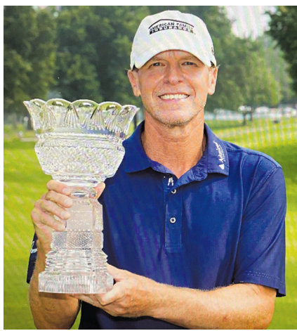
Steve Stricker shows off his latest prize – the Kaulig PGATour Champions Trophy won Sunday at the Firestone Golf Course in Akron, Ohio. It was Stricker's fifth win of the season and his third major championship on the Senior Circuit.