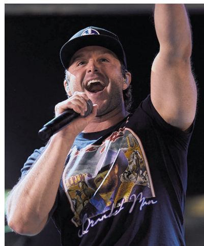
Edgertonians turned out in droves for the 52nd annual Tobacco Heritage Days. Among the many activities were a pie-eating contest, a children's tractor pull, a lip sync contest, and a concert by country star Easton Corbin. More photos on pages 3, 6, 12, 13.