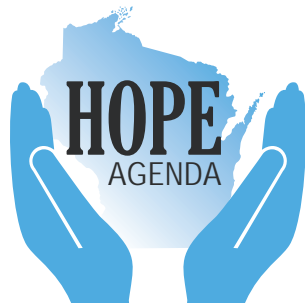
Heroin, Opioid Prevention and Education