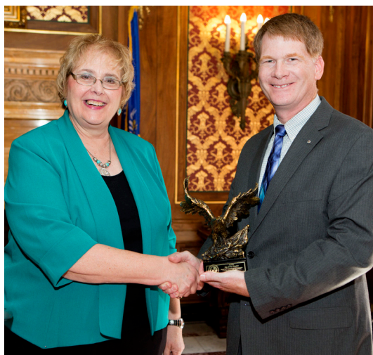
Receiving the 2017 William Wilberforce Freedom Award.