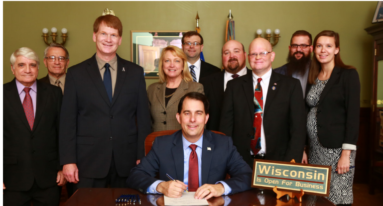
Gov. Walker signs AB 152 as a result of a constituent idea.