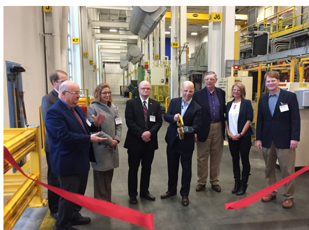
A ribbon cutting at another expansion project at Mercury Marine.