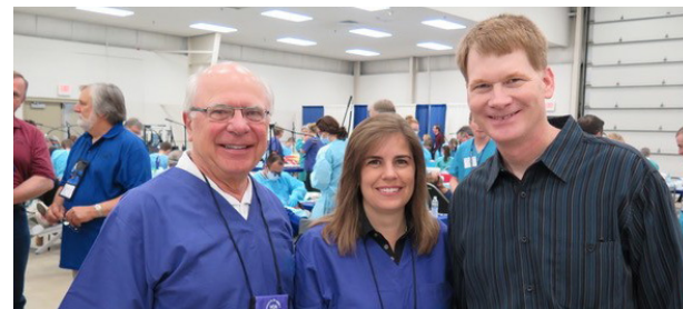
Volunteering during the Wisconsin Dental Association Mission of the Mercy Dental Clinic.

AB 332 – Nomination signatures for school boards (on Governor's desk) Allows a school district to reduce the nomination signature requirement (currently 100-200) for school board elections if a school district has less than 10% of its territory in a 2nd class city (i.e. Fond du Lac is a 2nd class city). This helps districts like North Fond du Lac, and 28 other districts, encourage more candidates to run for election to the school board.