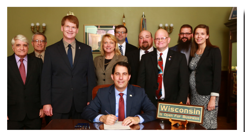
Gov. Walker signs AB 152 as a result of a constituent idea.