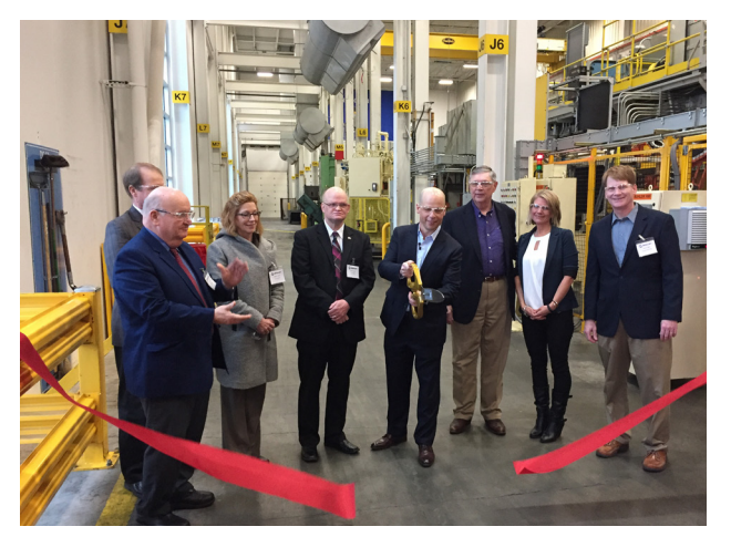
A ribbon cutting at another expansion project at Mercury Marine.