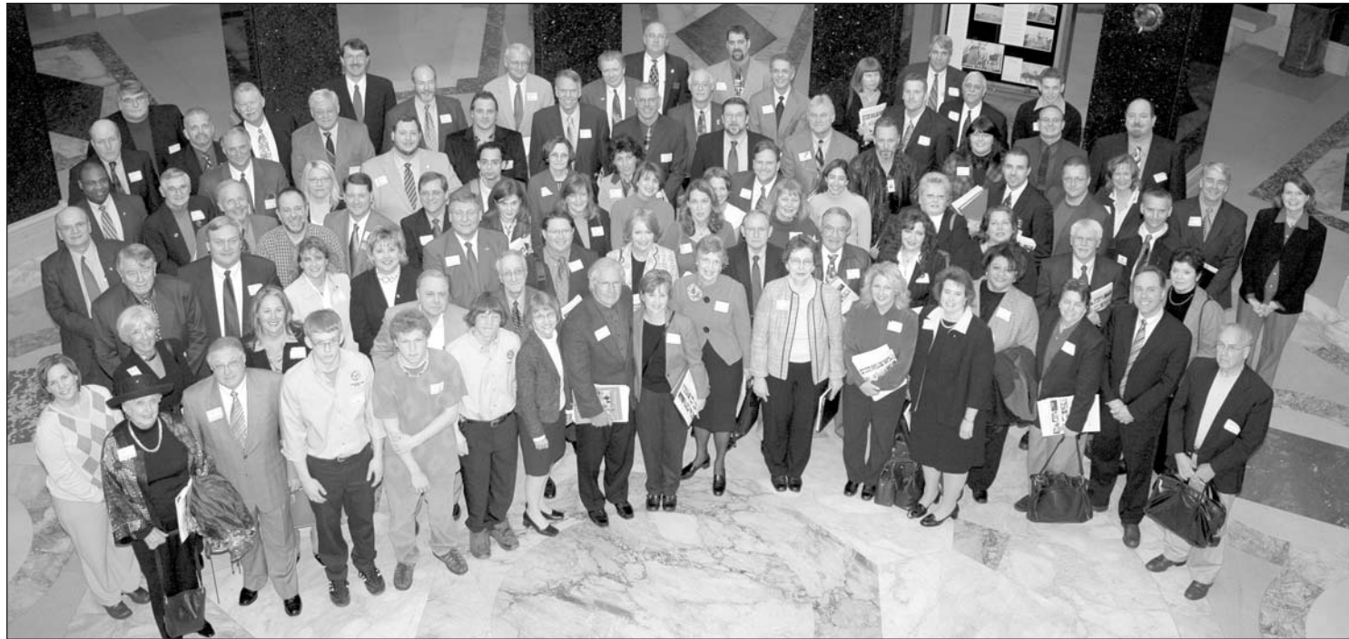
Rep. Turner joins the Racine County delegation at the start of Racine County Day, 2006.